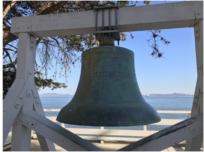
When You Look at the Bell...

The bell says 1910, because that's the year the Immigration Station opened! It stayed open until 1940.