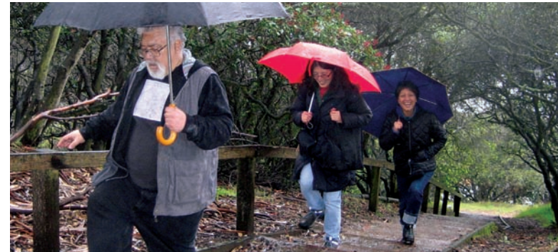
left Attendees walk to ceremony