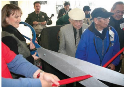
left Part of the crowd at the re-opening ceremony