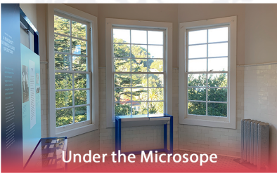
Under the Microscope