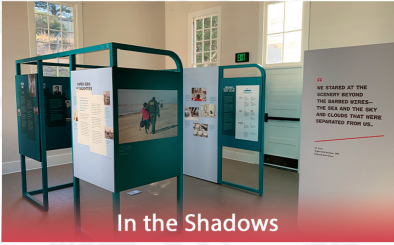
In the Shadows