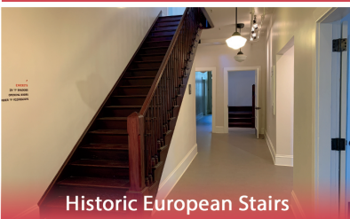
Historic European Stairs