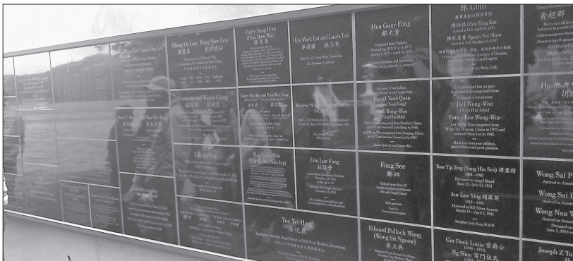
The first Immigrant Heritage Wall on Angel Island, completed in July 2011

Both walls designed by Daniel Quan Design. Plaque designs by Elaine Joe.