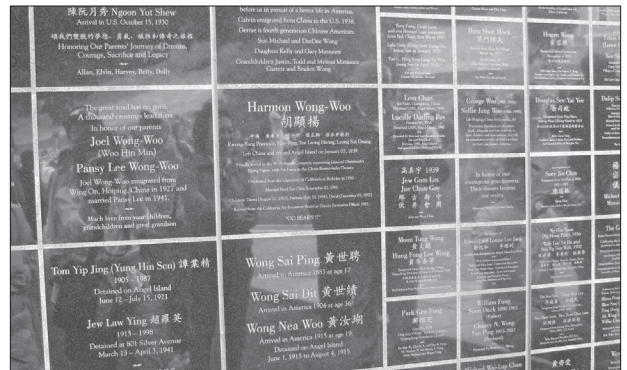
14" x 12" and 7" x 6" granite plaques on the first wall