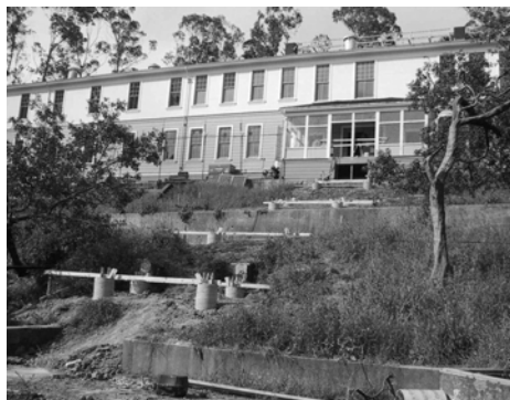
Construction has begun on the footings for covered walkway that will lead to the barracks.