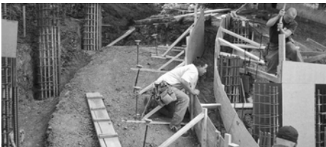
Work on the stair leading to the hospital sidewalk.

School and public programs will continue along the access road at the top of the site during the restoration efforts. For more information, call 415-435-3522.